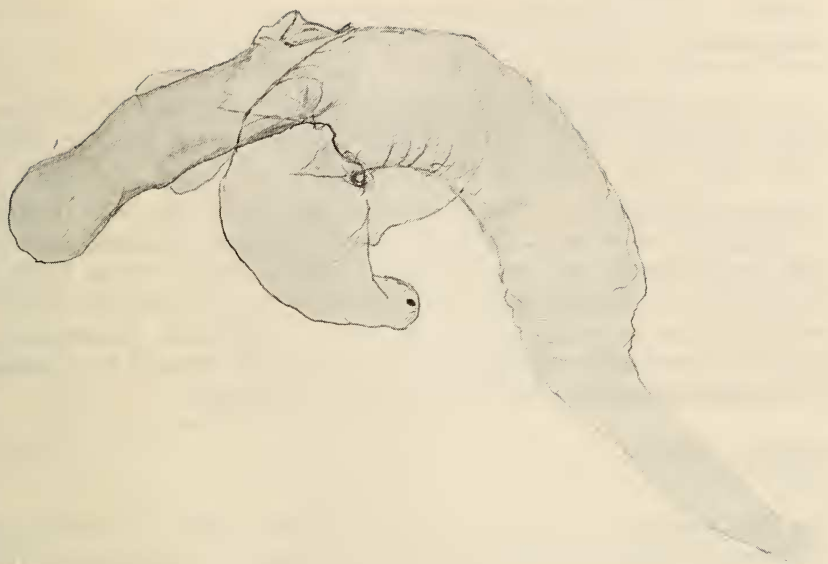
Fig. 4. Everted vesica of D. imperator (A. B.-H.) from Libya (A. MOBERG del.).